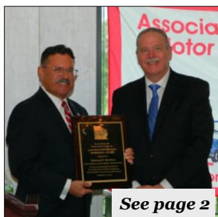
See page 2