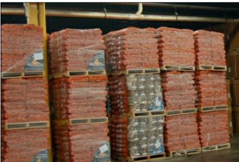
The company has 250,000 sq. feet of warehouse space in two NJ buildings