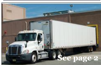
See page 2