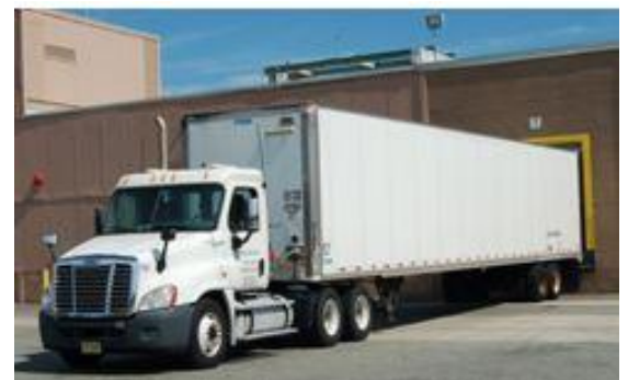
The company's transportation business has grown to a dedicated fleet of 22 company trucks in order to meet customer demand

For more information on Quality Warehouse & Distribution, visit www.qualitywarehouse.com .