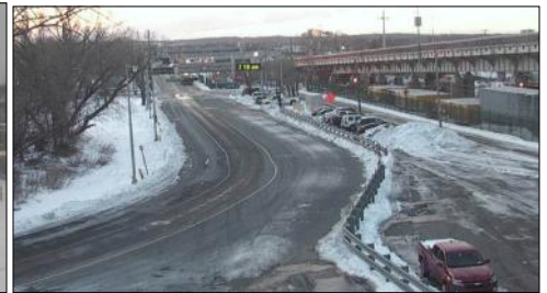
Open for Business: March 15, 2017