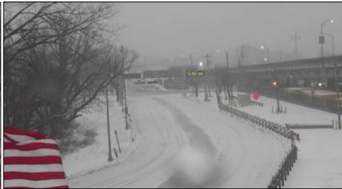
Blizzard Underway: March 14, 2017