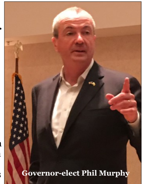
Governor-elect Phil Murphy